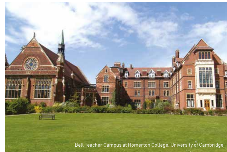
Bell Teacher Campus at Homerton College, University of Cambridge

Bell trains teachers throughout their career, from becoming a teacher and gaining a CELTA, to becoming an advanced practitioner, teacher trainer, or an academic manager with Delta. At Bell Teacher Campus we have a full range of development courses and cater for all levels and interests. We also run bespoke teacher training projects for groups all over the world.