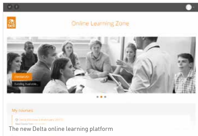
The new Delta online learning platform

Studying for the Delta online is great because it gives you the freedom and flexibility to fit the reading around other commitments.