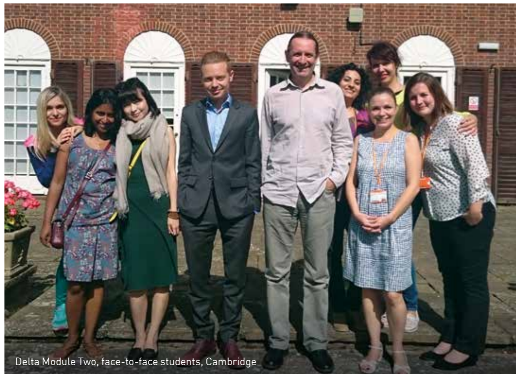
Delta Module Two, face-to-face students, Cambridge

EACH YEAR, BELL HELPS MORE THAN 200 TEACHERS STUDY FOR THEIR DELTA QUALIFICATION